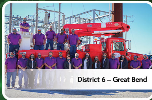
District 6 – Great Bend