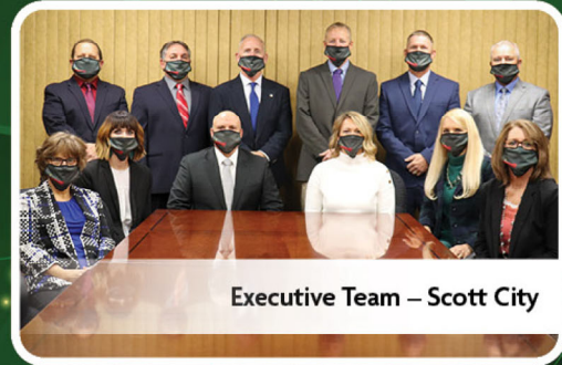
Executive Team – Scott City