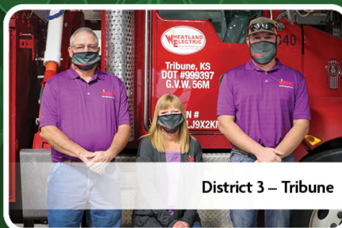
District 3 – Tribune