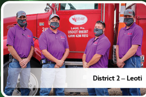
District 2 – Leoti