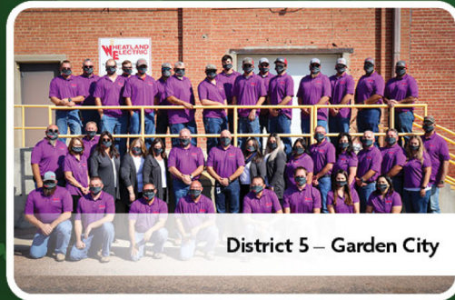
District 5 – Garden City

Our offices will be closed on Thursday, Dec. 24, and Friday, Dec. 25, for the Christmas holiday. We will be closed on Friday, Jan. 1, for the new year.