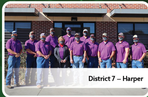
District 7 – Harper