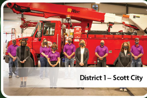
District 1 – Scott City