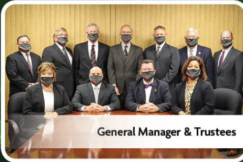
General Manager & Trustees