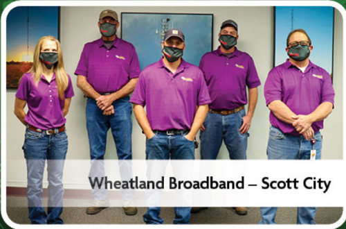
Wheatland Broadband – Scott City