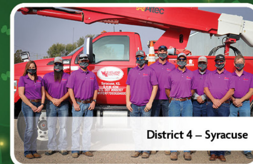
District 4 – Syracuse