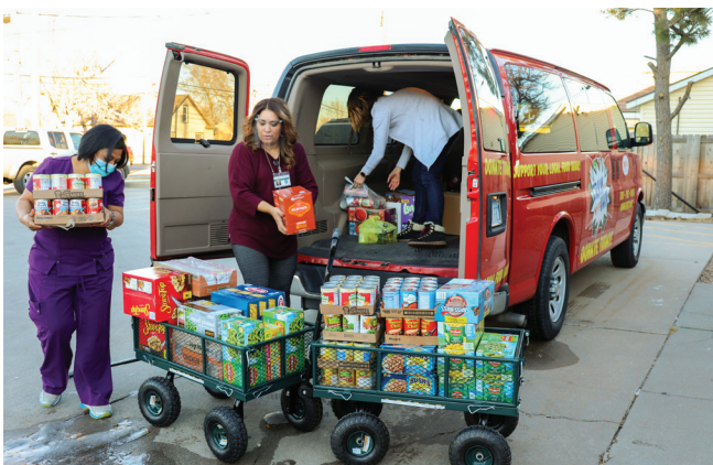
Representatives of Genesis Family Health in Finney County help unload Cram the Van food donations during the 2020 Cram the Van season.