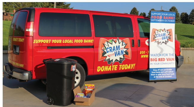
Every year, our Wheatland Electric van travels across our service territory to collect cash and can donations for local food banks. In addition to community get-togethers, we also host school food drive competitions, an annual charity golf tournament, promote online fundraising, host our Fall Finale in Scott City and more!