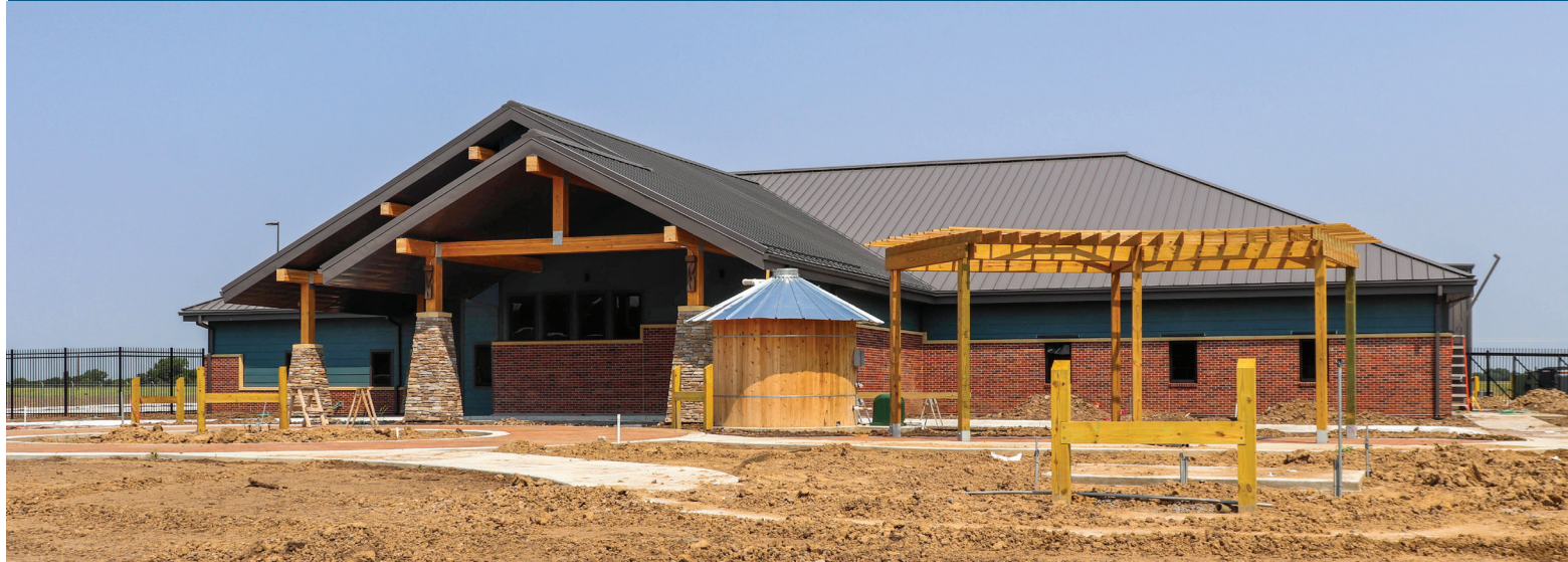
This photo from Aug. 9, 2021, shows our new green space is still a work in progress outside our new building at 200 10th St. in Great Bend.