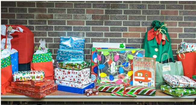
Wheatland employees in Great Bend also contributed gifts for kids in the foster care system via Saint Francis Ministries' Angel Tree program this past Christmas.

We feel lucky to have generous employees who care, and we appreciate everything social service agencies like Saint Francis do to help those most vulnerable in our communities.