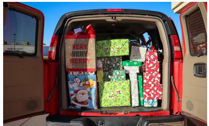
Wheatland Electric employees crammed the van — this time with Christmas presents — for nearly 100 children across our southwest and south-central Kansas service territory.