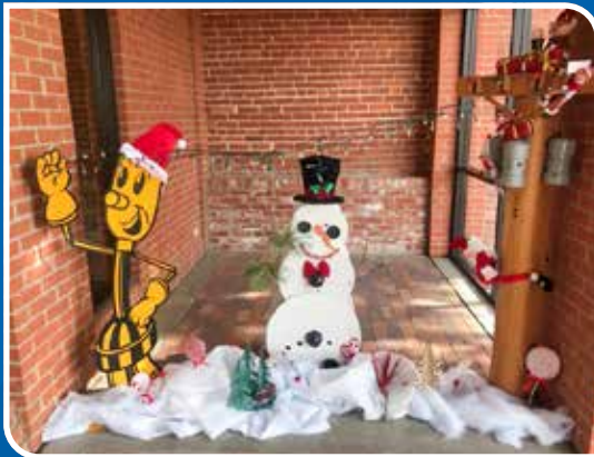
Willie Wiredhand with Frosty the Spoolman greeted members in the Garden City lobby.