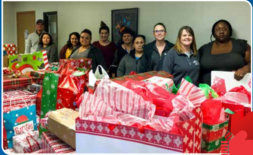
Wheatland employees pitched in to collect gifts for 89 children through St. Francis Ministries' Christmas Wish List program.