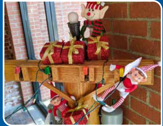
Some mischievous elves got off the shelf and onto Wheatland's training utility pole in Garden City.