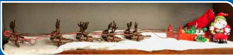
Santa's arrester terminator bracket "sleigh" being pulled by his hotline clamp "reindeer".