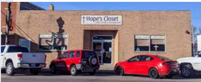
Hope's Closet thrift store and breadbasket is located at 309 Main Street in Scott City.

During Thanksgiving and Christmas, the breadbasket (food pantry) puts together approximately 140 “meal boxes” filled with all of the trimmings including turkeys for Thanksgiving and hams for Christmas. Each box provides a family with an opportunity for a joyous holiday meal.