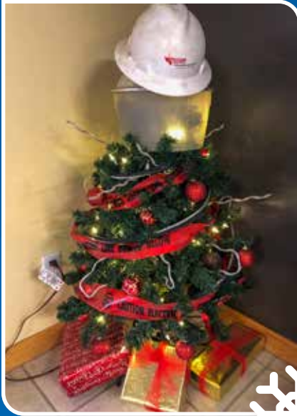
A security light cover and a hard hat made a the perfect tree topper in Tribune.