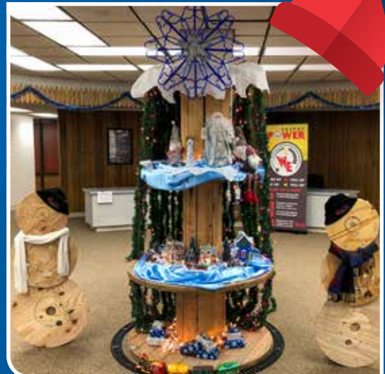
Empty wire spools made great snowmen and a Christmas tree at the Great Bend office.