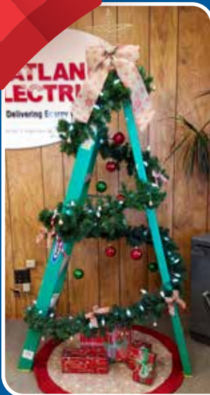
A ladder from the warehouse made a creative Christmas tree with a lot less mess in Leoti.

Along with the Christmas decorations, Wheatland found other ways to spread the holiday cheer. Once again, Wheatland employees participated in the Saint Francis Ministries Christmas Wish List Program. Altogether, 38 Wheatland employees helped provide Christmas presents for 89 children in our service territory. Thank you to all of those who made this a Holiday Season to remember.