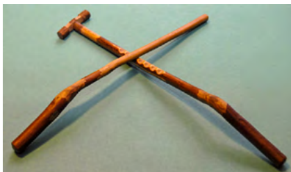
A Whimmydiddle is a wooden toy consisting of a notched stick with a smaller stick attached on the end.

In 46 years, Whimmydiddle has never been canceled. There’s been wind, rain and snow, but thousands still attend. Alpha Omega Sorority consists of 18 members who rotate through eight to nine different roles/committees to ensure Whimmydiddle is a success.