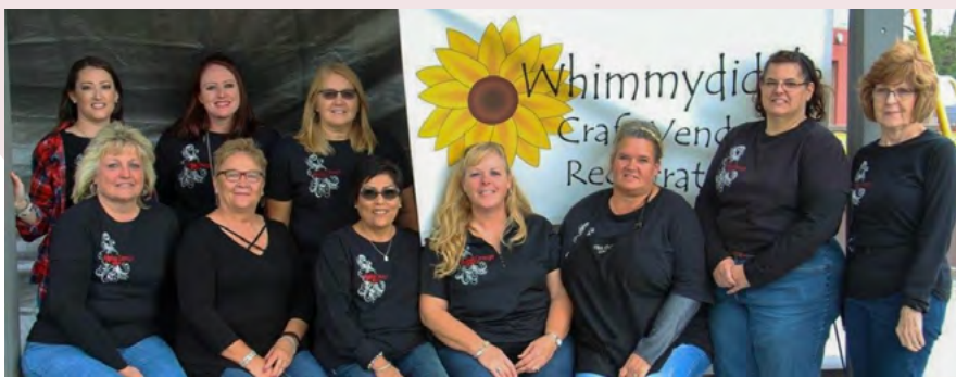
The Women of Alpha Omega Sorority work countless hours to ensure the success of Whimmydiddle.

handmade items. The event attracts 15-20 new booths each year. Some vendors, like the Raggedy Ann vendor, have participated in the fair since its beginning and others for the first time. Whimmydiddle attracts vendors from all over the world. The ever-popular kettle corn vendor comes from Wyoming each year; the nesting eggs vendor travels from Russia.