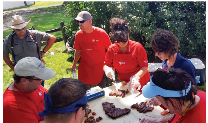
Wheatland employees and family members prepare thousands of tiny bite-sized pieces of steak for the annual Beef Tasting Booths in Scott City.