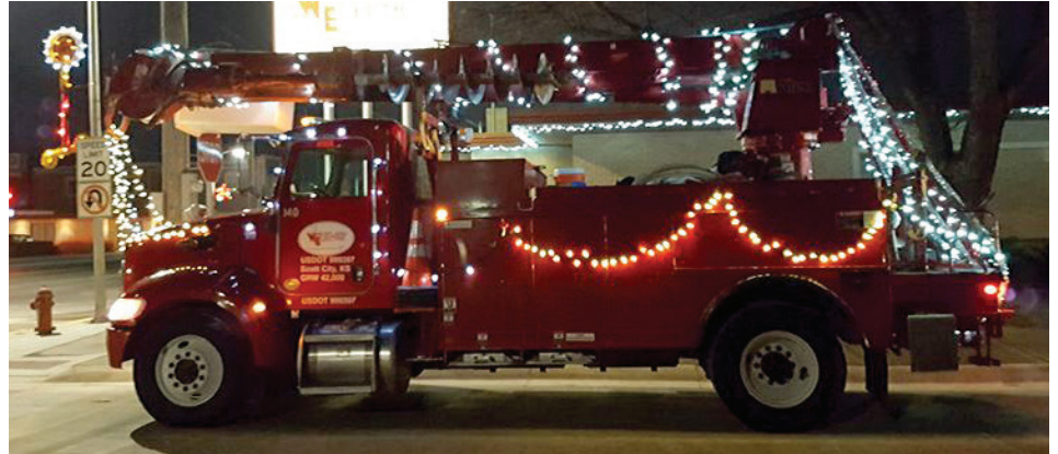
Employees from the Scott City office turned a bucket truck into a mobile Christmas light display in the Chamber of Commerce's annual Christmas light parade.