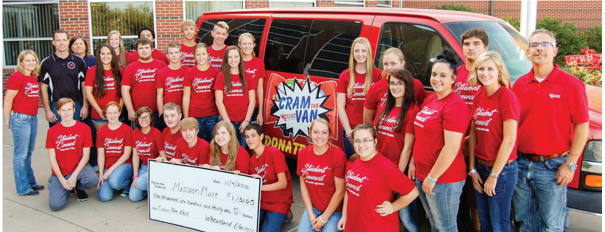
Wheatland, Conway Springs High School and Hired Man's Grocery and Grill teamed up to donate $1,131.65 and 348 pounds of food to the Mission Mart in Conway Springs in 2016.