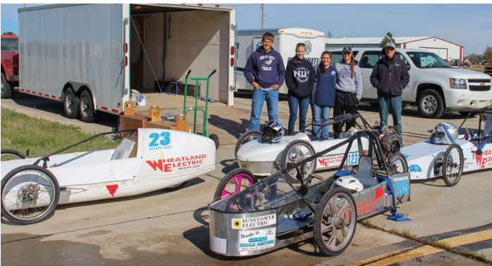
The Scott Community High School ElectroRally team prepares for race day. Wheatland sponsors electric car programs in Scott City and Great Bend as well as helping to put on the annual Sunflower ElectroRally race held at the Scott City Municipal Airport.