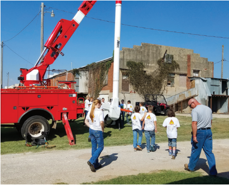
Wheatland is a proud supporter and participant in the annual Safety Day in Caldwell where students learn about safety of all kinds, including electrical safety.