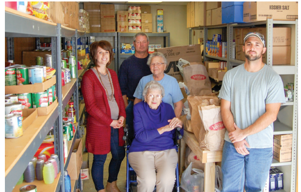
Last year, Wheatland and its members in Tribune collected 620 pounds and $50 for the Greeley County Food Bank.