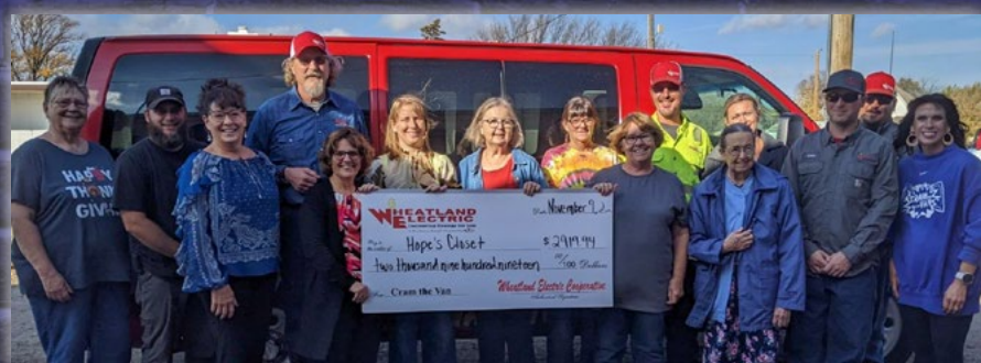
Representatives of Hope's Closet in Scott City accept a check for $2,919 from our 2022 Cram the Van campaign.