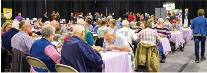
A record 814 individuals attended Wheatland Electric's 2023 Annual Meeting on April 26. The meeting was held in Scott City and seven other meeting locations in Leoti, Tribune, Syracuse, Garden City, Great Bend, Harper and Caldwell.

voted 320-287 to pass revisions to the cooperative's bylaws. These revisions include the following changes: