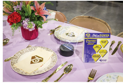
A centerpiece display commemorating WEC's 75th anniversary at the annual meeting in Scott City on April 26, 2023.