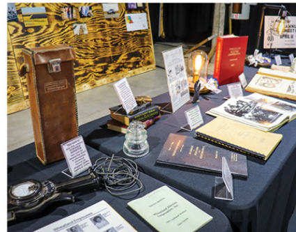
Historical items were on display in Scott City reflecting 75 years of shared cooperative history at WEC.