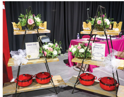
Attendees at this year's annual meeting received a Dutch oven and spoon rest, custom engraved by students from Wichita County High School, as a special 75th anniversary gift.

In addition to the election of trustees, members