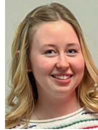
Hayla Edwards Scott Community High School