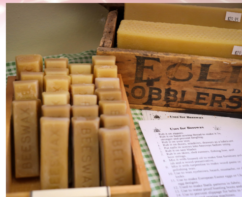
RIGHT: Beeswax, a natural byproduct of the honey-making process and more valuable than honey itself, has many household, cosmetic and even cooking uses.

in their local area, their first call is to the Rowans. Swarming is a colony’s natural means of reproduction — when a single colony splits into two or more — and can most often be seen in large clusters on tree branches.