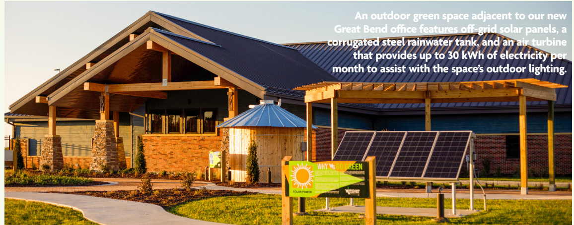
An outdoor green space adjacent to our new Great Bend office features off-grid solar panels, a corrugated steel rainwater tank, and an air turbine that provides up to 30 kWh of electricity per month to assist with the space's outdoor lighting.

We're also excited to share that just outside our new Great Bend